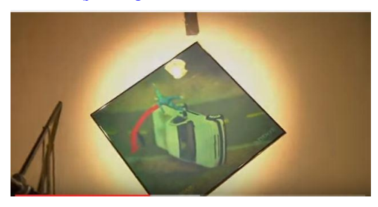
<u>February 18:</u> Do you love them enough? Make sure they're in #TheRightSeat https://www.youtube.com/watch?v=BxmnXv6LjcA

https://www.youtube.com/watch?v=QYqjsH7cgGY&t=107s