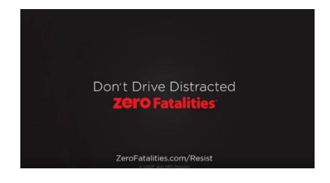
February 17: Help us promote traffic safety and reach our goal of Vision Zero! Send us a message to use our hologram board - it's free!

February 16: Distracted driving is something we have the ability to stop. Take personal responsibility behind the wheel. #ItCanWait #VisionZeroND https://www.youtube.com/watch?v=kSxkrglEibo